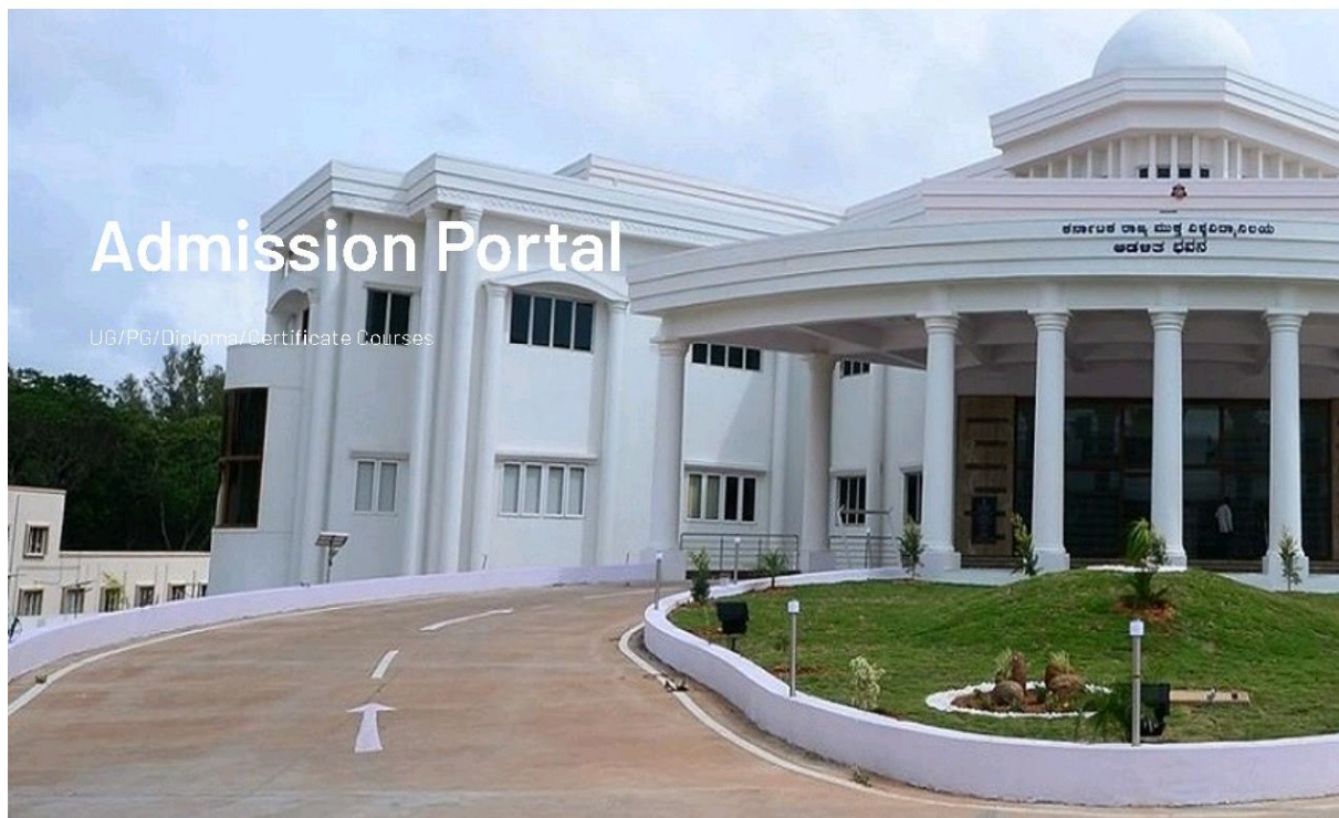
Figure: showing the Main Screen.

Home General Instructions Regional Center Student FAQ Support