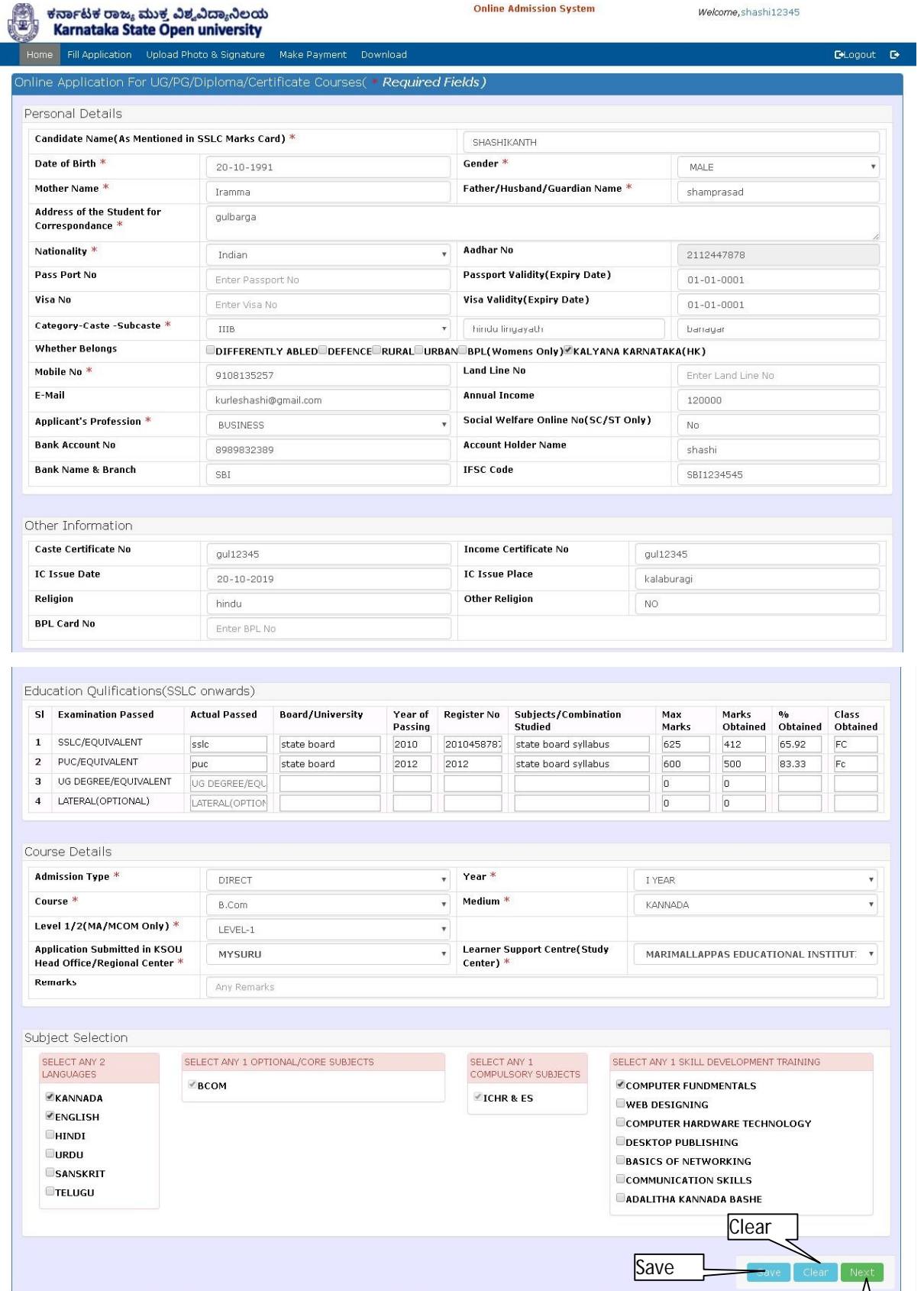
Figure: showing the Online Application Entry Form filled with Illustration data